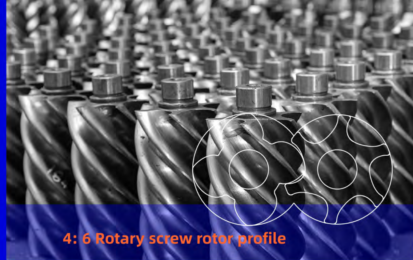
4: 6 Rotary screw rotor profile

The core components are 85% patented High precision integrated coordination